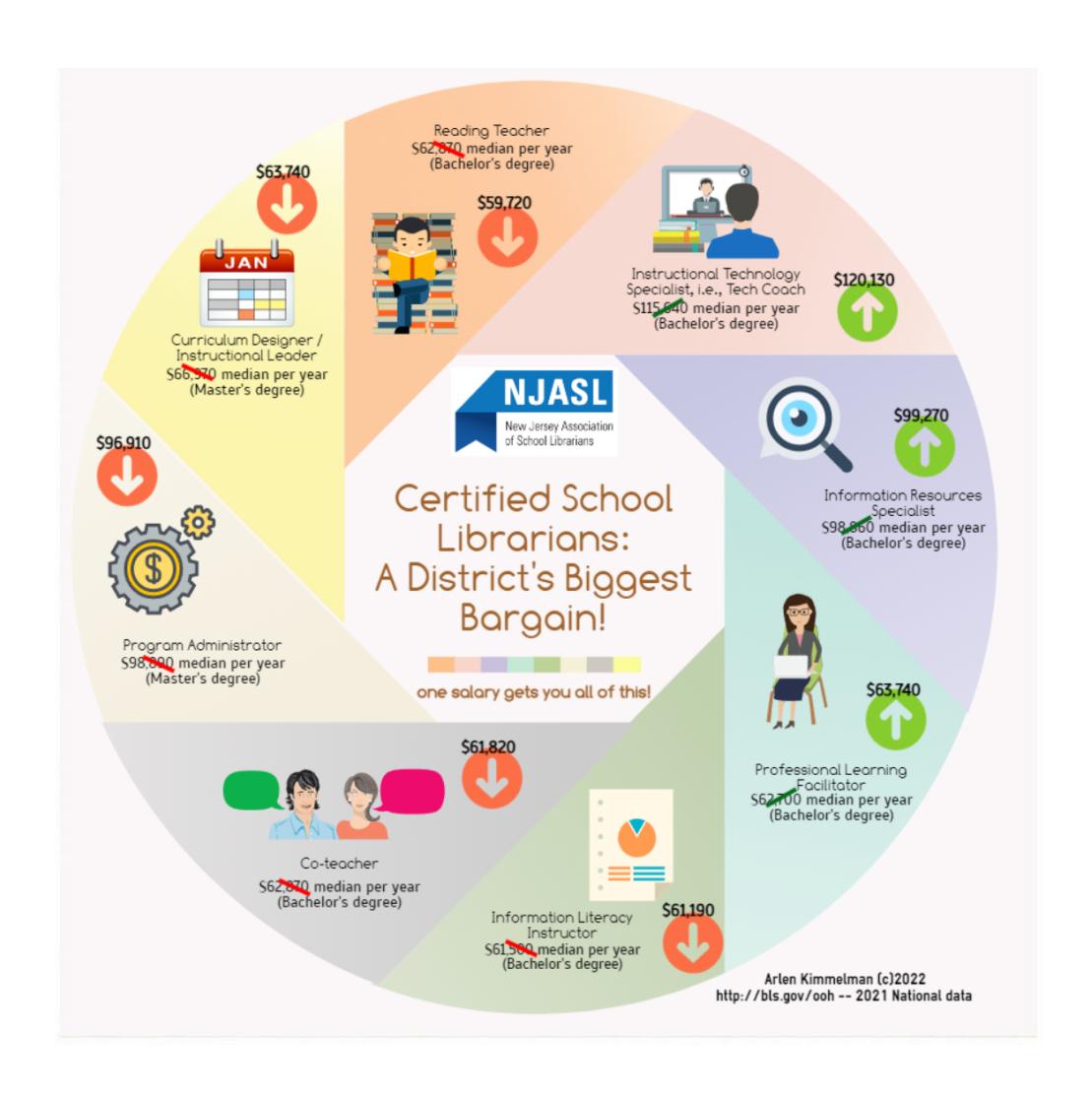
Appendix D Certified School Library Media Specialist: A School District's Biggest Bargain